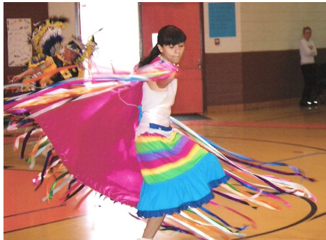
Koshares perform at La Junta High School.